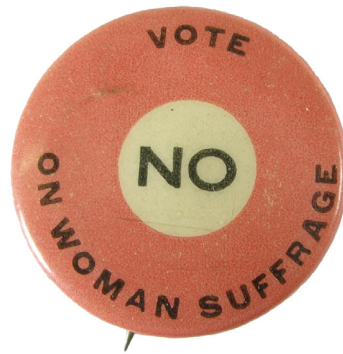
Anti-Suffrage campaign button, circa 1916. New Hampshire Historical Society, gift of Stanley A. Hamel.

In New Hampshire, one of the most promising opportunities to secure the right to vote for women came in 1902 at the state constitutional convention. Of the many amendments to the constitution that were considered, the one pertaining to women's suffrage was the most controversial. Speakers at the convention convinced the delegates to strike the word "male" from the provisions of the state constitution regarding the right to vote. Following a vote of 145–92 among the delegates, the referendum was sent to New Hampshire voters in March 1903 as Question 7 on the ballot. Voters defeated it, with 62 percent casting ballots against the change.