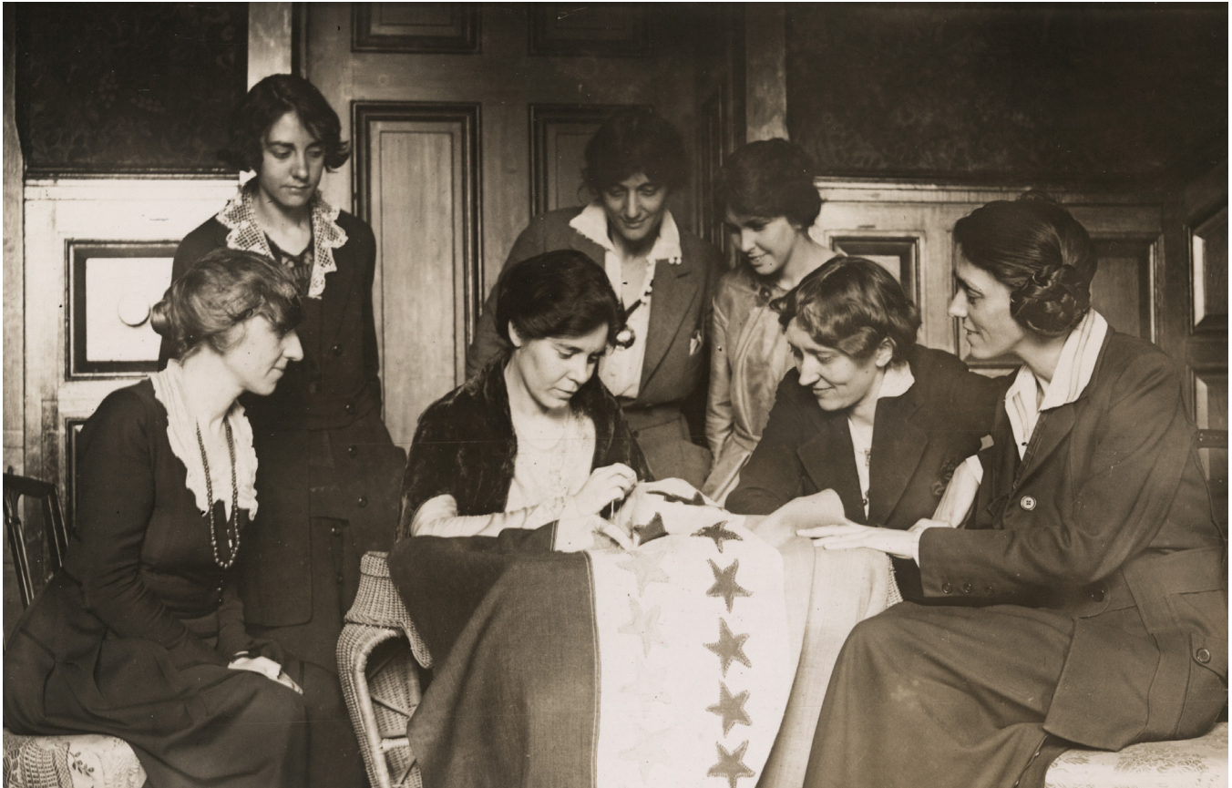
Alice Paul (1885–1977) was a founder of the National Woman’s Party (NWP), an organization focused on the passage of a constitutional amendment ensuring women’s suffrage throughout the United States. Each time a state voted to ratify the 19th Amendment, Paul (center) sewed a star onto the NWP Ratification Flag. National Photo Company, Washington, D.C., circa 1919. Courtesy of the Library of Congress.