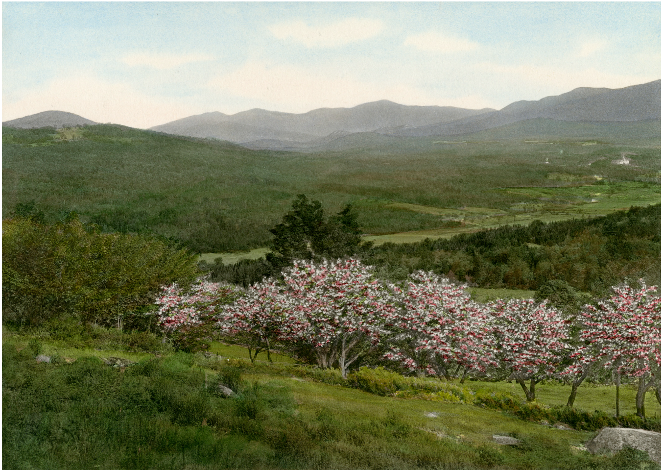
New Hampshire's apple blossoms are in full bloom in this springtime photograph by Charles H. Sawyer (1868–1954) of Concord, N.H. The White Mountains from Sugar Hill is one of 70 hand-colored photographs the New Hampshire Historical Society purchased from Sawyer in 1928. The entire set is available for viewing via the Society's online collections catalog at nhhistory.org .

The independent nonprofit that saves, preserves, and shares New Hampshire history.