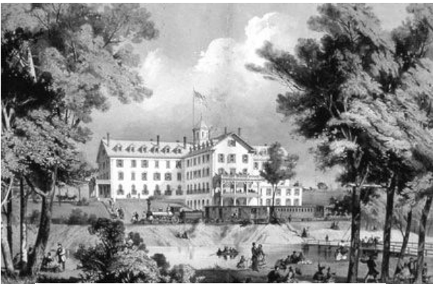
Pemigewasset House, Plymouth (c. 1857)